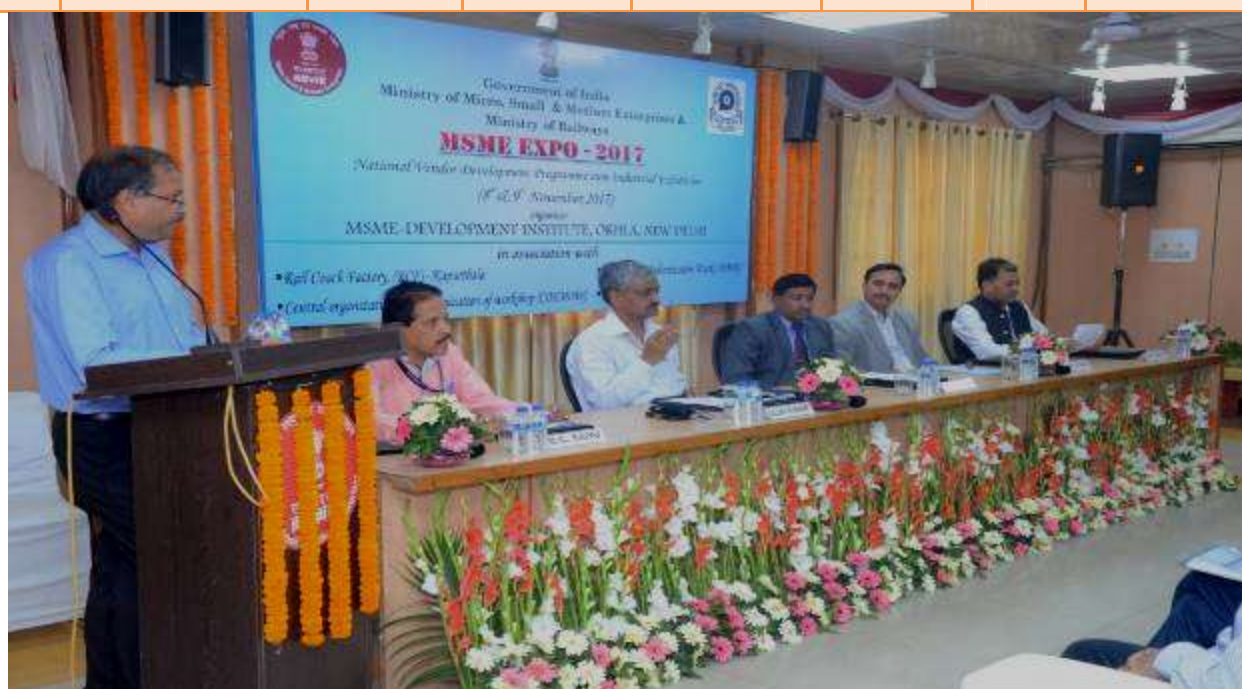
Dignitaries on Dais during Inaugural Function of National Level Vendor Development Programme at MSME – DI, Okhla, New Delhi on 8 th November, 2017