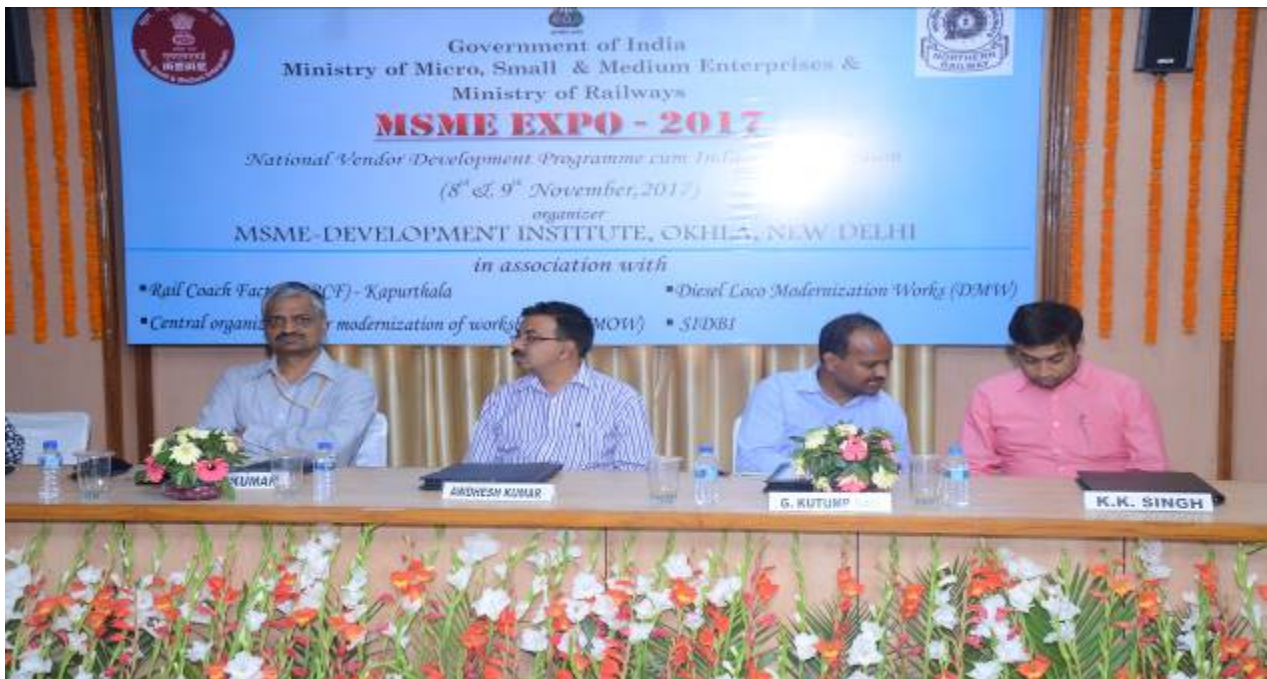
Dignitaries on Dais during Valedictory Function of National Level Vendor Development Programme at MSME – DI, Okhla, New Delhi on 9 th November, 2017