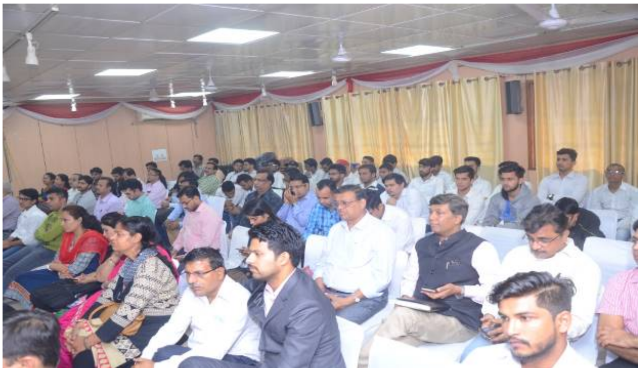
Audience during Inaugural Function of National Level Vendor Development Programme at MSME – DI, Okhla, New Delhi on 8 th November, 2017