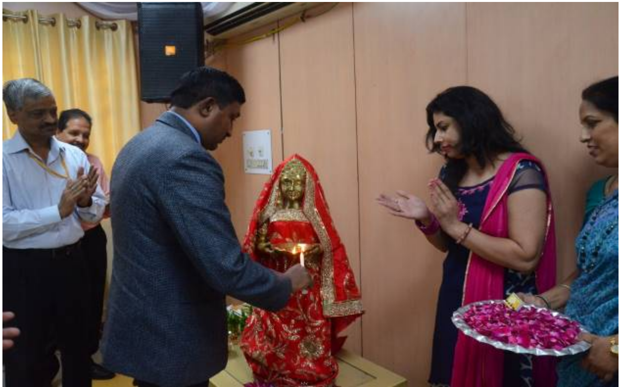
Lighting of Lamp during Inaugural Function of National Level Vendor Development Programme at MSME – DI, Okhla, New Delhi on 8 th November, 2017