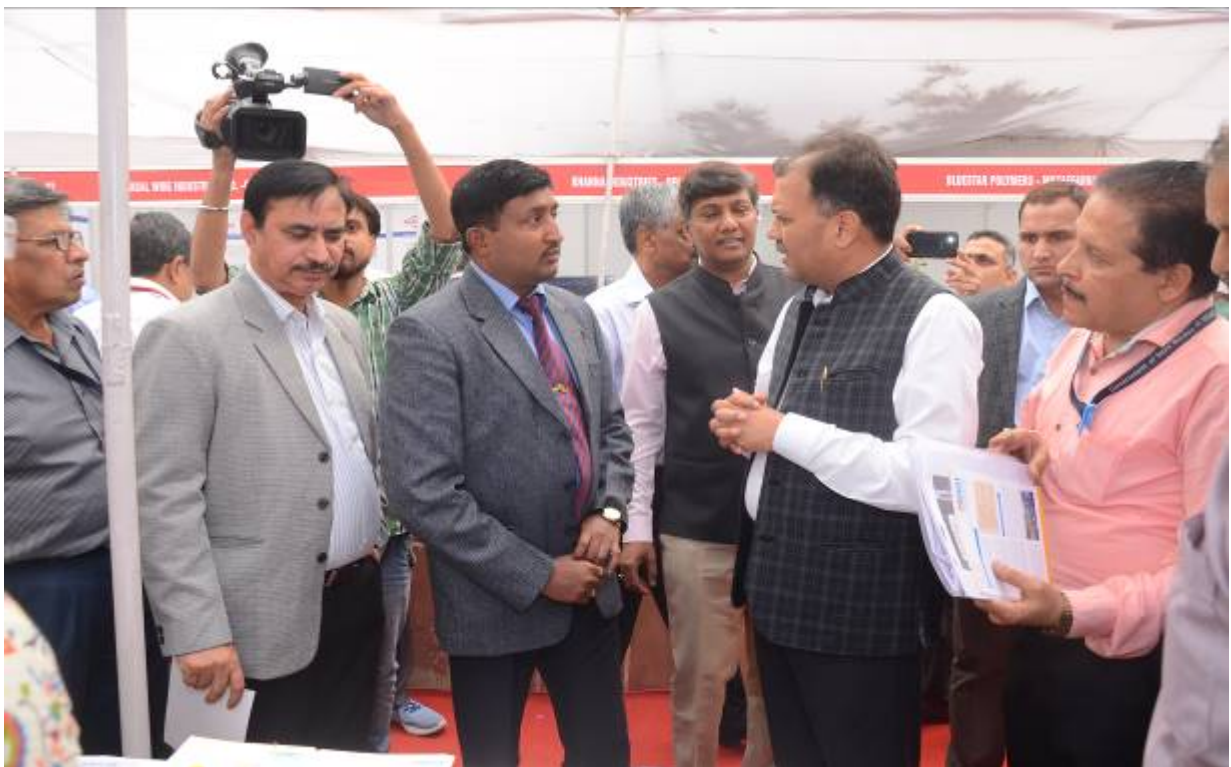
Dignitaries Interacting with Participants during National Level Vendor Development Programme at MSME – DI, Okhla, New Delhi on 8th November, 2017