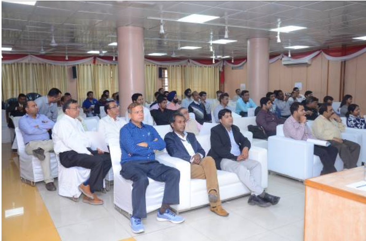
Audience during Valedictory function of NVPD at MSME-DI, Okhla, New Delhi on 9 th November, 2017