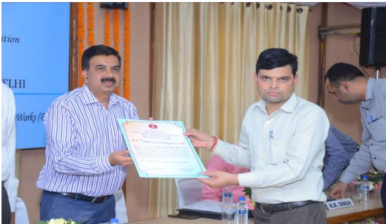
Certificate distribution during Valedictory Function of National Level Vendor Development Programme at MSME – DI, Okhla, New Delhi on 9 th November, 2017