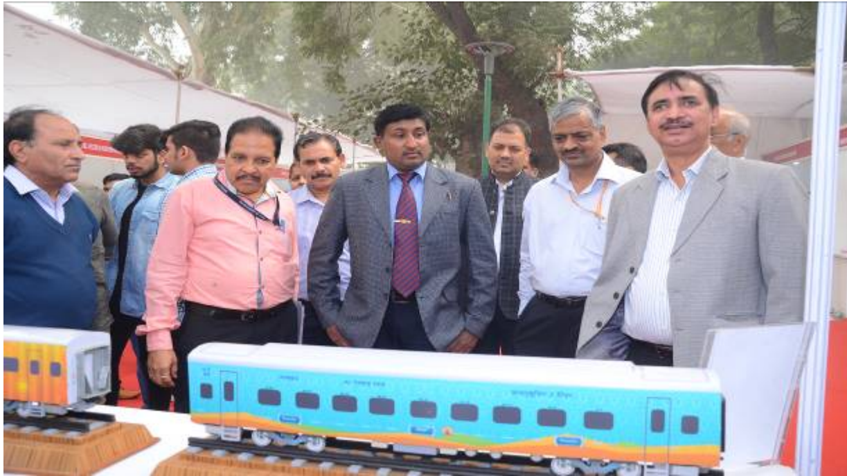
Dignitaries Interacting with Participants during National Level Vendor Development Programme at MSME – DI, Okhla, New Delhi on 8th November, 2017