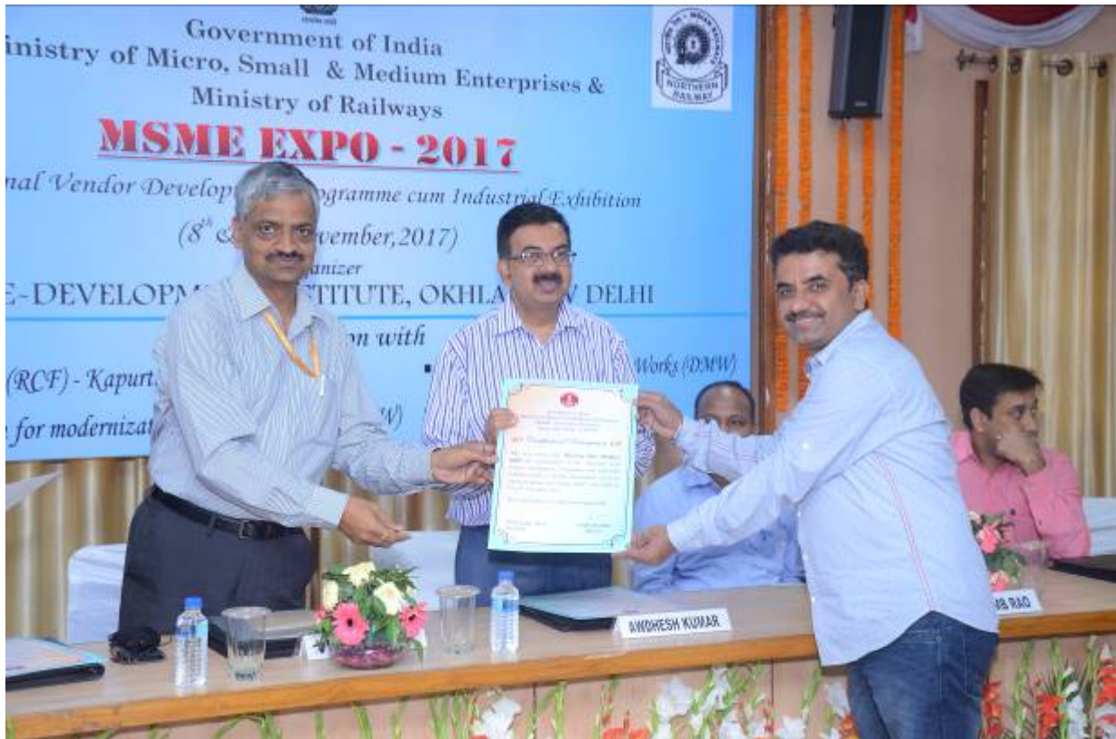
Certificate distribution during Valedictory Function of National Level Vendor Development Programme at MSME – DI, Okhla, New Delhi on 9 th November, 2017