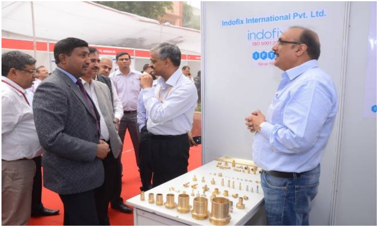
Dignitaries Interacting with Participants during National Level Vendor Development Programme at MSME – DI, Okhla, New Delhi on 8th November, 2017